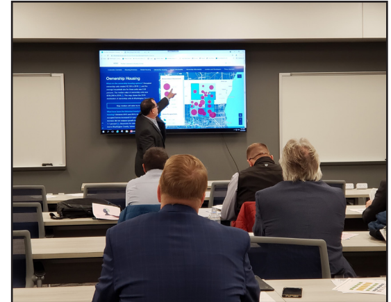
Breakdown of Attendees